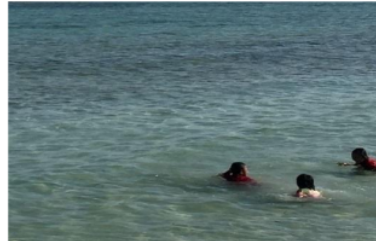
D: Seawater play (Swimming)