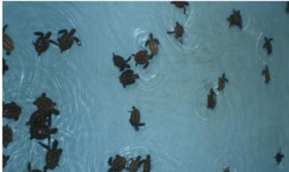
C: Hawksbill Breeding