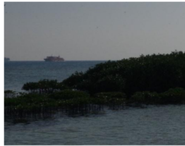
B: Travel to explore the Mangrove Forest with a Canoe