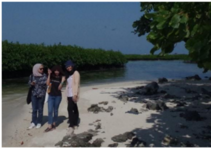
A: Hawksbill Release Area