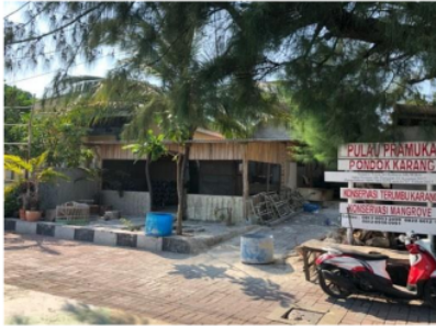
A: Pondok Karang and Mangrove community involvement forum for conservation

hr a day, and have reached every house on Pramuka Island, while forlodging, hotels and homes for tourists to stay are available.(Figure 3).