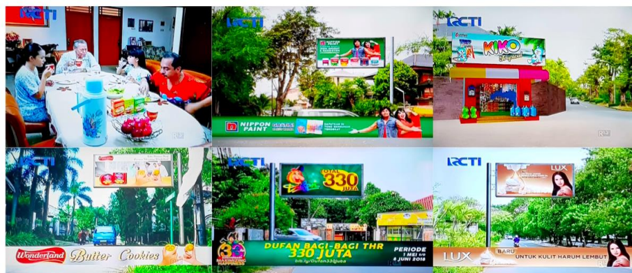
Figure 2. Digital placement product.

"Yes, usually the character of the audience if there are advertisements, they immediately move the channel. They don't want to watch advertisements, but like there are unwritten rules between other television stations, or peering at each other whether the television station is next to the advertisement or not. Our adverts are also advertisements or vice versa. The audience finally also got an advertisement if they moved the channel," Roy said.