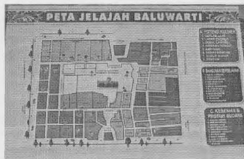
Figure 7. Sample of Direction Indication Map for Visitor (Personal Data, 2015)

Conclusion; in case revamping is done comprehensively as in the above description by getting the society involved as subject in the settlement (active participation in the field), managed and packed atratively and naturally with tourist support development facilities, Baluwerti Kasunanan Surakarta is ready to welcome the visit of abroad and domestic tourists.