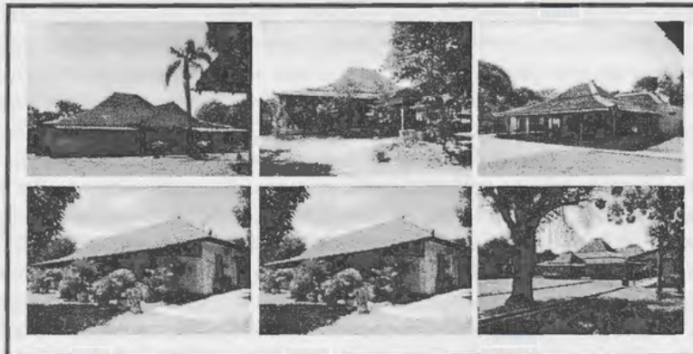
Figure 3. Prototype of Dalem Pangeran (Modifikasi Penulis) (District Administration of Surakarta, RTBL Baluwerti Village of Surakarta City of 2010)