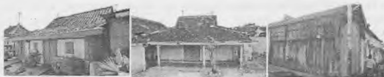
Figure 4. Prototype of Residences of Abdi Dalem and Sentana Dalem (Personal Data, 2014)

During Karaton as administration centre thus street access surrounding karaton follows direction of pradaksina (clockwise direction). The street surrounding karaton may only be passed by pedestrian, cyclist, and horse carriage. Nowadays since karaton village location is strategic thus indirectly it makes this area as liaison area between the north and the south of Slamet Riyadi street (center of Surakarta city). Likewise with numerous facilities spread over in the vicinity of the area, then ample vehicles using royal village or karaton village as connection with the nearby environment, as effect the pedestrians are not comfortable and threatened their safety, street layer is swiftly damaged, the atmosphere becomes hustle and bustle and is not comfortable. Besides, along the street there grows commercial activities not guided well and having impact on karaton corridor countenance.