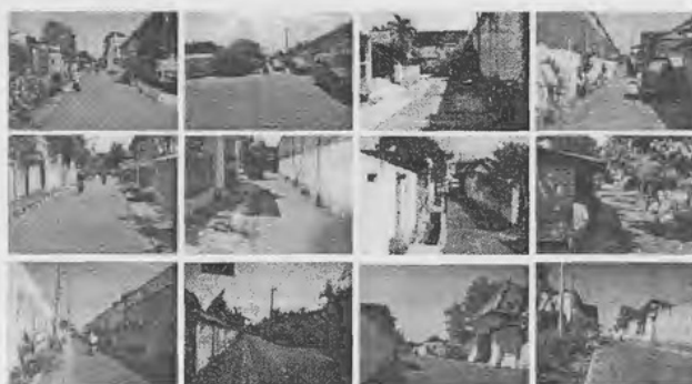
Figure 5. Prototype of Street at hand in the vicinity of Karaton (Modified by Writer) (PEMDA Surakarta, RTBL of Baluwerti Village of Surakarta City of 2010)

During Karaton as administration centre thus street access surrounding karaton follows direction of pradaksina (clockwise direction). The street surrounding karaton may only be passed by pedestrian, cyclist, and horse carriage. Nowadays since karaton village location is strategic thus indirectly it makes this area as liaison area between the north and the south of Slamet Riyadi street (center of Surakarta city). Likewise with numerous facilities spread over in the vicinity of the area, then ample vehicles using royal village or karaton village as connection with the nearby environment, as effect the pedestrians are not comfortable and threatened their safety, street layer is swiftly damaged, the atmosphere becomes hustle and bustle and is not comfortable. Besides, along the street there grows commercial activities not guided well and having impact on karaton corridor countenance.