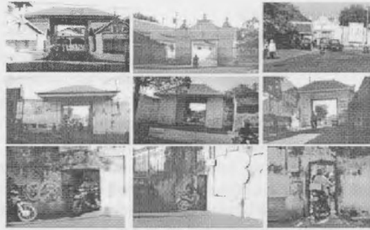
Figure 6. Prototype of Entry Door of Complex Karaton Kasunanan Surakarta (Modified by Writer) (PEMDA Surakarta, RTBL of Baluwerti Village of Surakarta City of 2010)